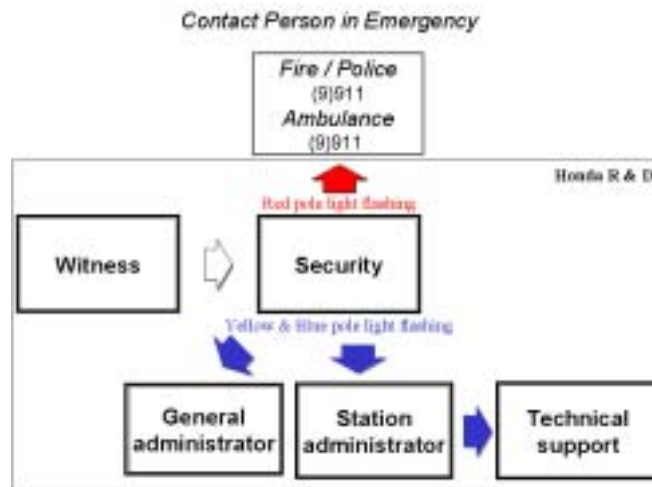
Figure 5: Contact person in emergency

The plan also documents who is to be contacted at each emergency level (see Figure 5).