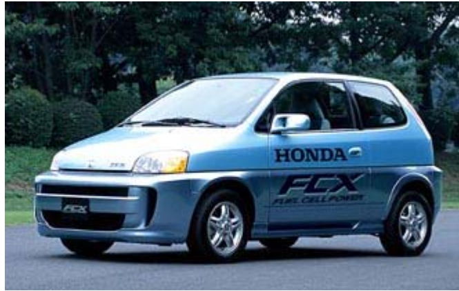
Figure 4: Photograph of the Honda FCX hydrogen fuel cell-powered car

After the vehicle is properly positioned at the station, the fueling process involves the following steps: