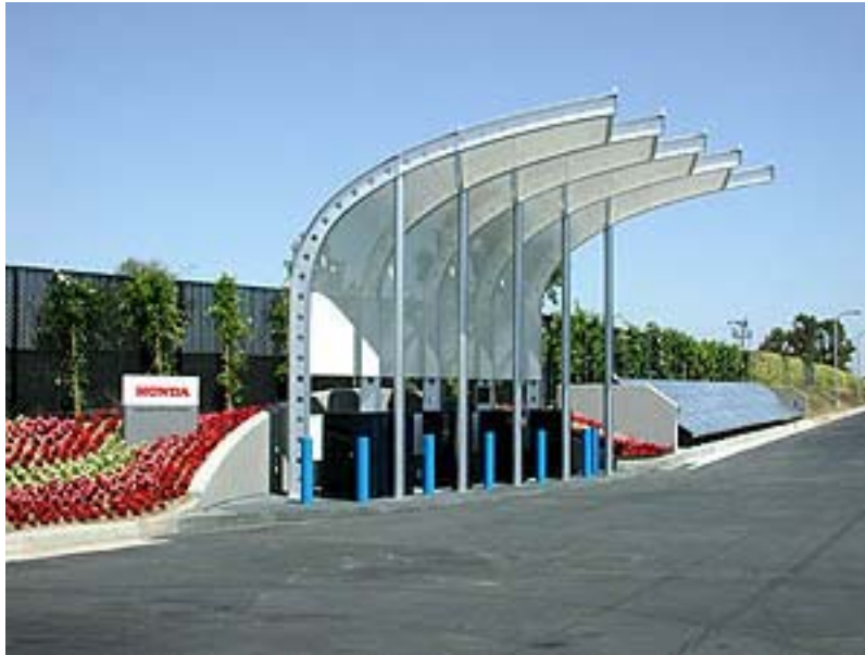
Figure 1: Honda's hydrogen production, storage and fueling station in Torrance, CA