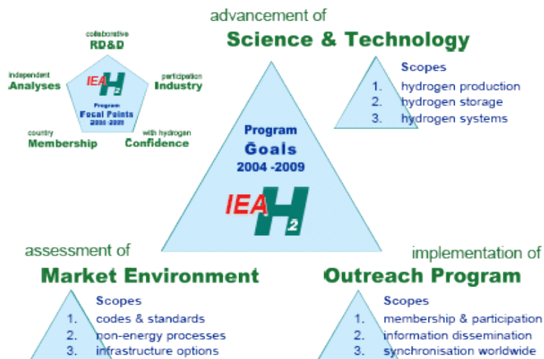
Figure-3: Principal goals and scopes of 5-year HIA program during term 2004 – 2009.

Overall, RD&D and analyses efforts of the HIA will be designed and structured for the main benefit of systems integration, subsequent validation and optimization. This is mandatory to facilitate the phased implementation of a robust hydrogen infrastructure and, ultimately, to support comprehensive market penetration of hydrogen technologies.