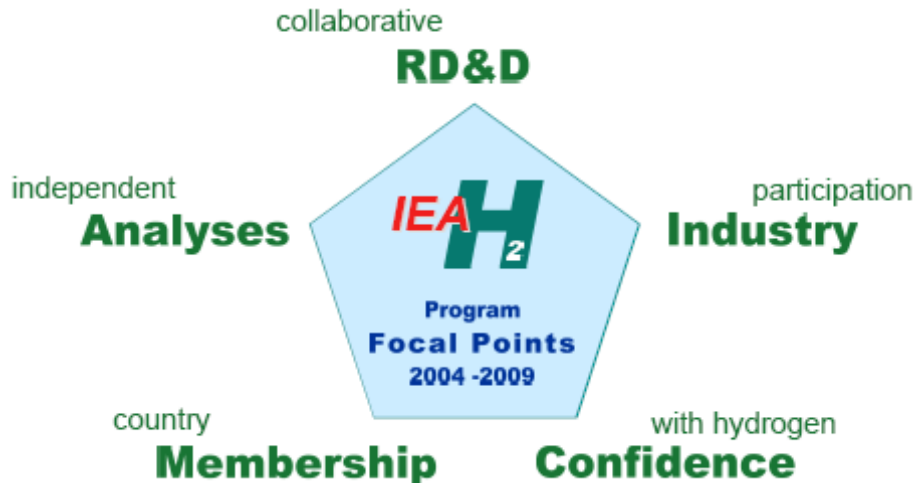
Figure-2: Five focal points of 5-year HIA program during term 2004 – 2009.