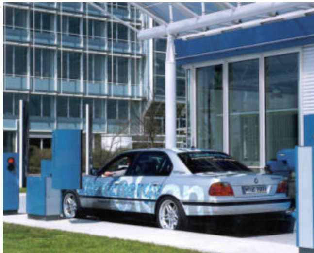
Figure 7: Liquid hydrogen filling station

The filling station infrastructure will be expanded in the next project phase. A second hydrogen production unit (steam reformer) and a second dispenser unit for pressurized hydrogen will then be integrated into the existing filling station layout.