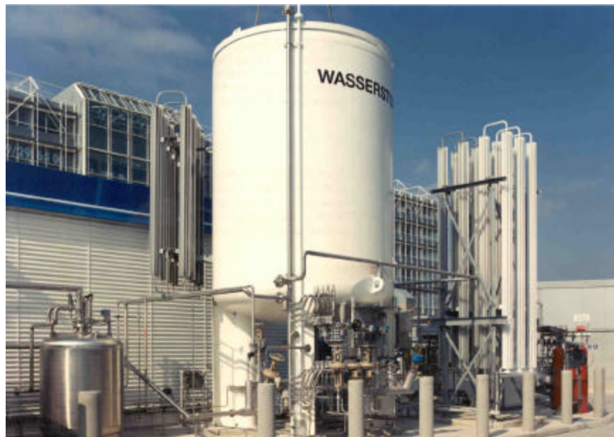
Figure 3: Linde liquid hydrogen tank plant

Hydrogen is stored in vehicles in two aggregate states: liquid frozen in thermally insulated tanks or in gaseous form in high-pressure cylinders. The liquid hydrogen filling station at Munich Airport can supply both systems. For this, liquid hydrogen is delivered in tanker vehicles from the Linde hydrogen plant in Ingolstadt and filled into a 12,000 l tank (see Figure 3).