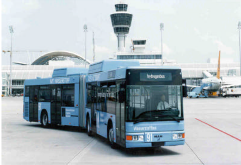
Figure 5: MAN low-floor articulated bus

Project phase 2 was started in mid-2001. Operation of the articulated buses on the apron is continued in the subsequent phases of the project. As part of the further development of the hydrogen drive train, detailed improvements are planned both to the engine and to the gas line. The articulated buses will continue to be filled with gas on the apron using 25 MPa compressed hydrogen.