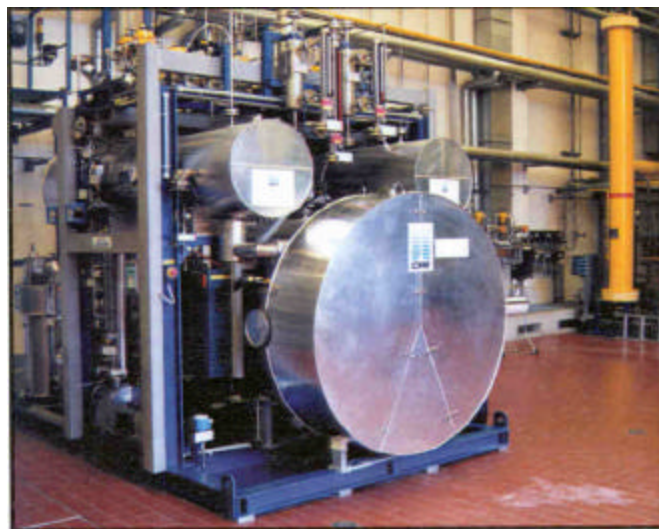
Figure 2: The interior of the GHW electrolyser

In GHW's electrolysis plant at Munich Airport, a number of major innovative plant component systems and operating functions were realized for the first time. The high-speed pressure relief in the event of an emergency cut out, for example, is a patent pending innovation, which takes the special requirements of the Airport into consideration. The system design and functions were realized on the basis of a safety study, with the assistance of the TÜV authorities, amongst others. MTU Friedrichshafen GmbH was not only the supplier of the key technology, but is also the operator of the system.