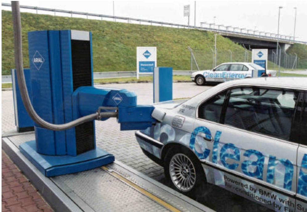
Figure 4: Liquid hydrogen robot dispenser

In the first project phase, the filling robot carried out 500 filling operations. The time taken to fill a tank with a volume of 125 l is approximately three minutes. The use of the cold drawable Linde coupling means that it is possible to fill several vehicles consecutively without any problem.