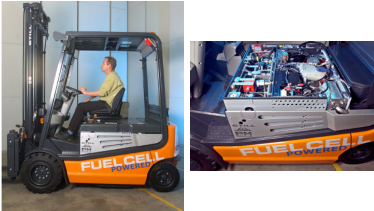
Figure 6: Forklift truck and associated PowerPack