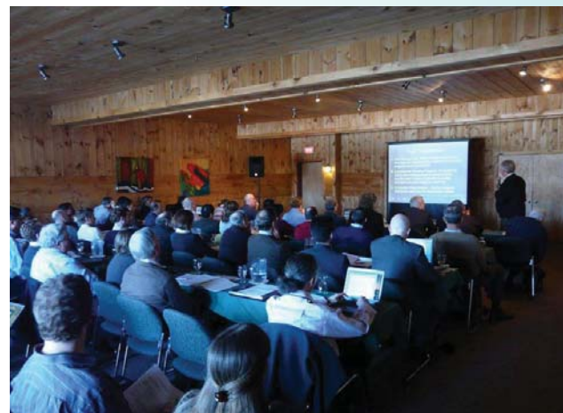
Sacacomie Task 22/Task 19